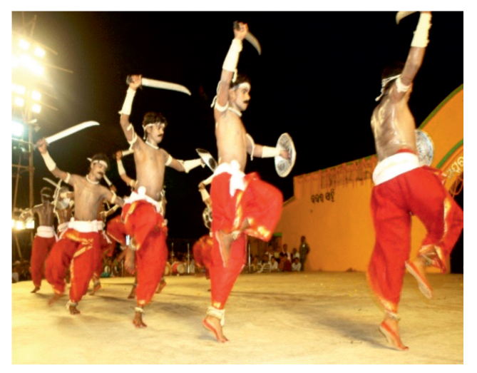
Figure 1: Annual Chhau Dance Performance