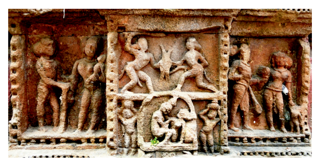
Figure 4: Traditional War & Erotic Scenes from Akhaṇḍaleśvara Temple, Prataprudrapur, Odisha, India, 11th CE.