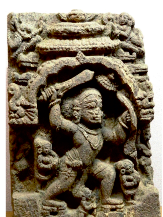
Figure 5: Heroic Posture, OSM, Bhubaneswar, (Kanasaha in Puri) 13<sup>th</sup>-14<sup>th</sup> CE.