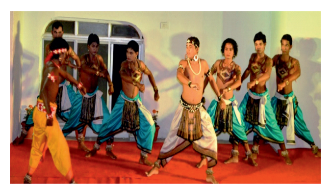
Figure 2: Performance of Heroic Posture by Group of Male Dancers